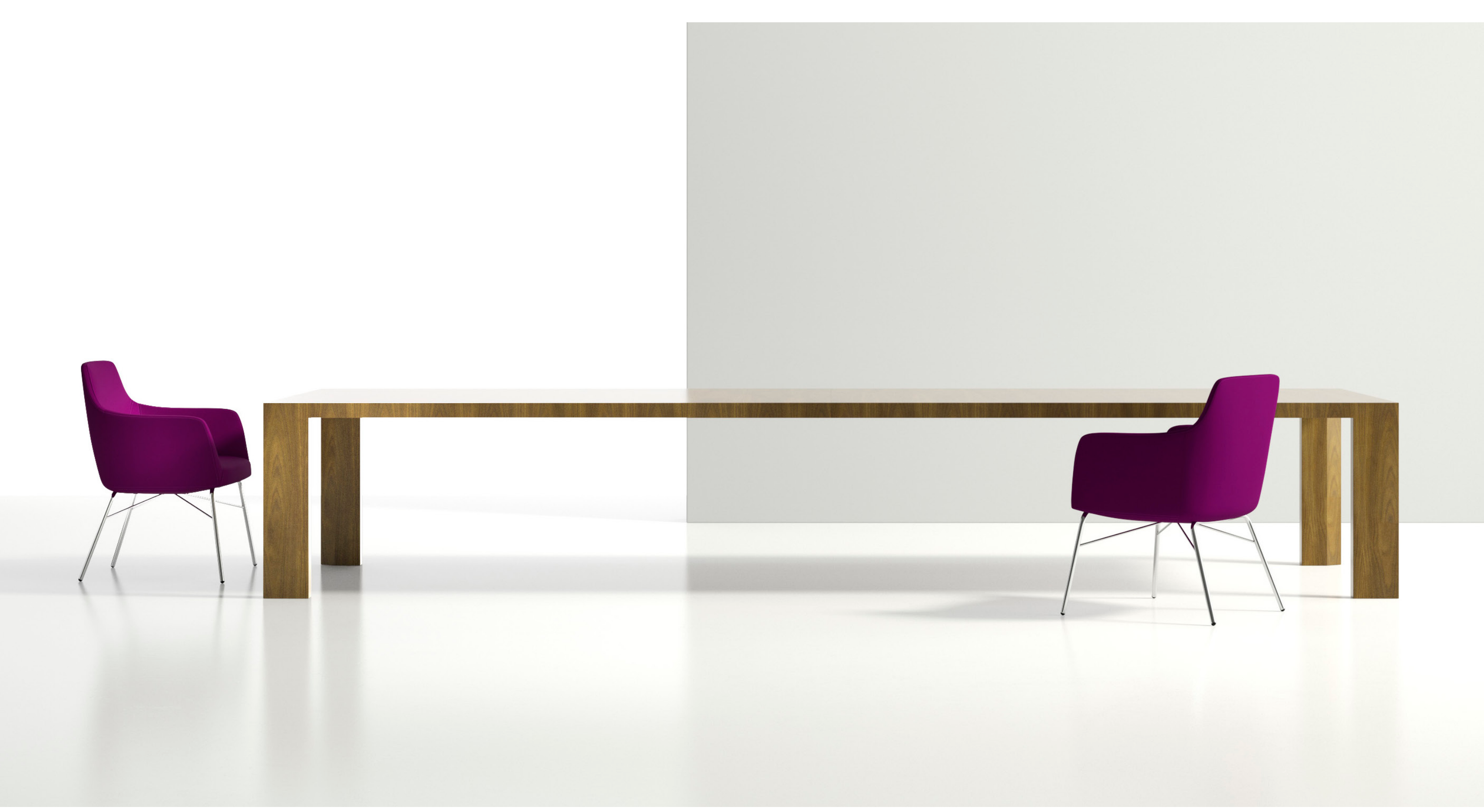
RATIO IN FLAT-CUT WALNUT #125, 30" HEIGHT