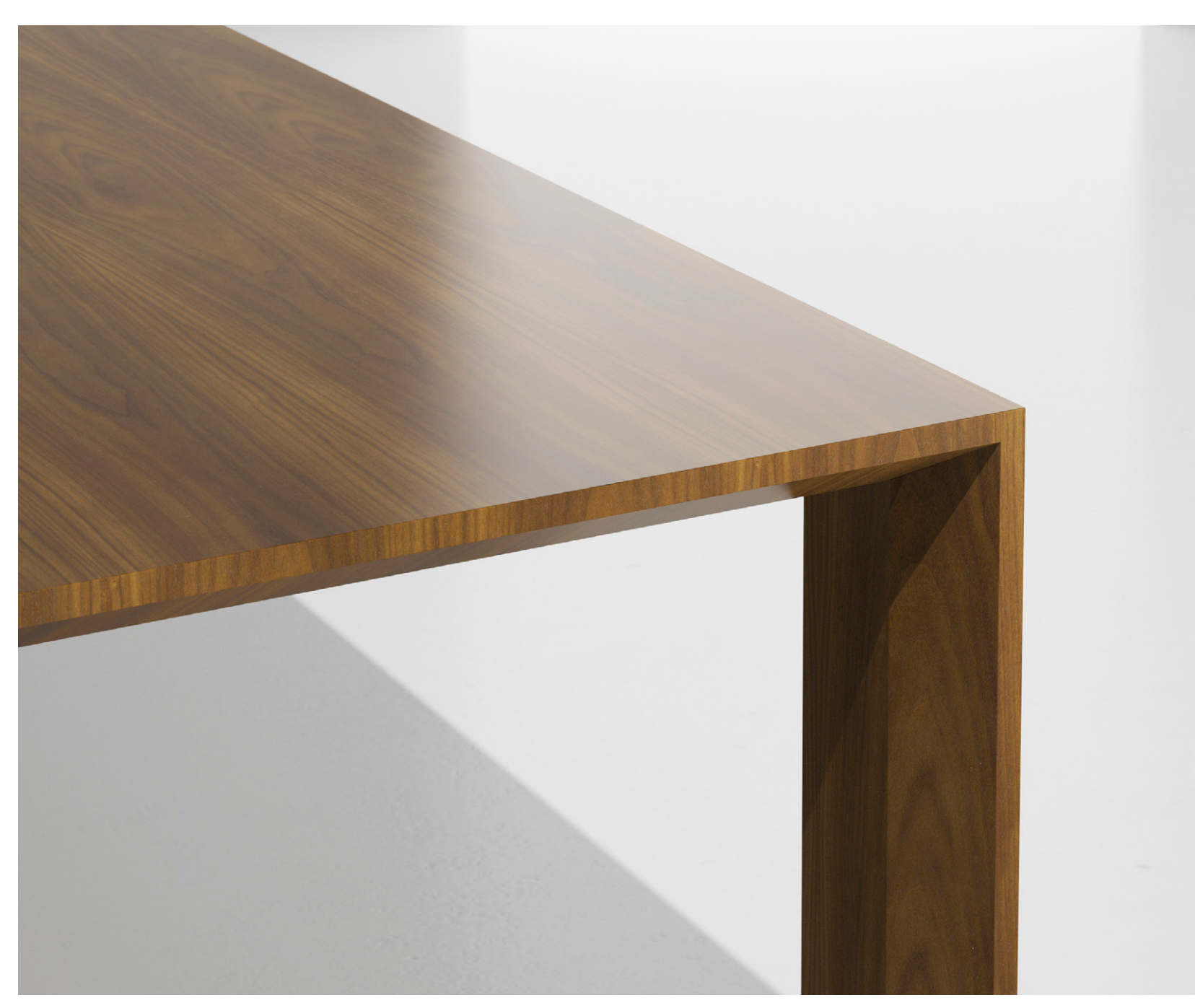
RATIO IN FLAT-CUT WALNUT #125

Designed by Brian Graham, the Ratio table reinvents the classic farm table in modern form, accommodating purpose and function in a straightforward manner that makes clear the merits of decorum, the value of fine materials and the enduring value of the table as a place to gather, connect and celebrate. "An elegant table," says Graham, "is a tangible presence, a surface and a site that invites us to participate, to converse, to exchange ideas and form alliances. It is an icon of transaction and esprit de corps." Robust yet refined, the beauty of this simple table is testament to the craftsmanship and veneer artistry of Decca Contract.