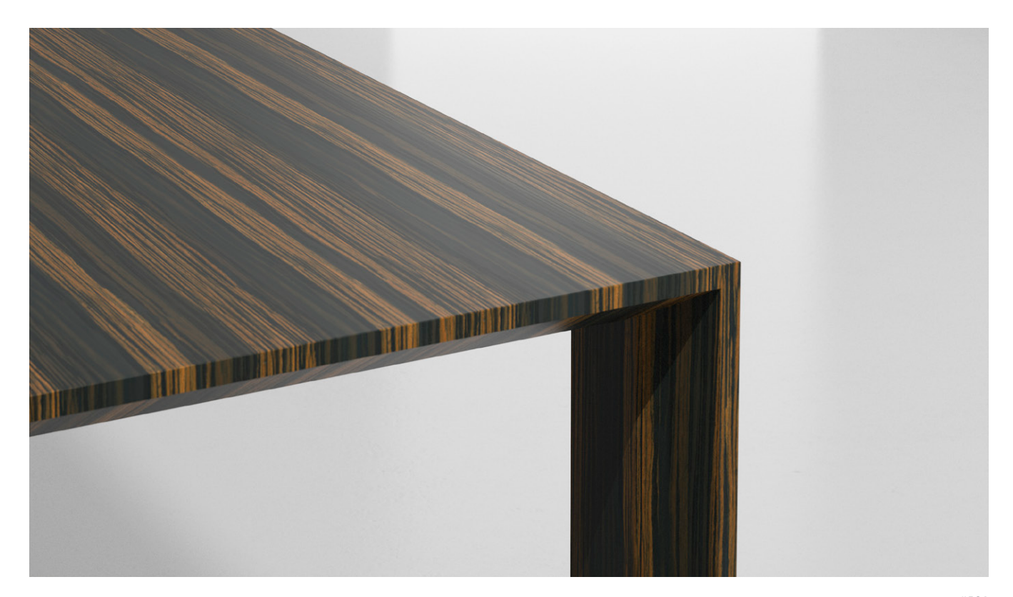
RATIO IN EBONY #502