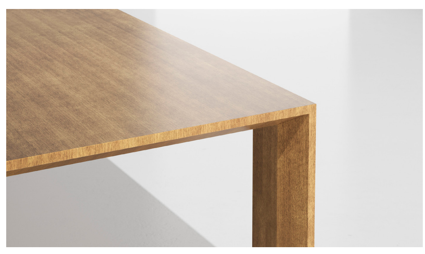
RATIO IN QUARTER-CUT NATURAL OAK #126